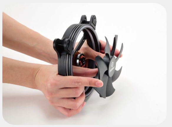
Detachable blade for easy cleaning