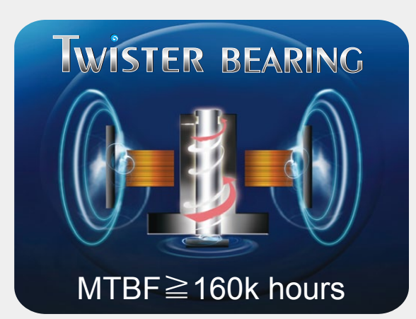
Long life and low noise