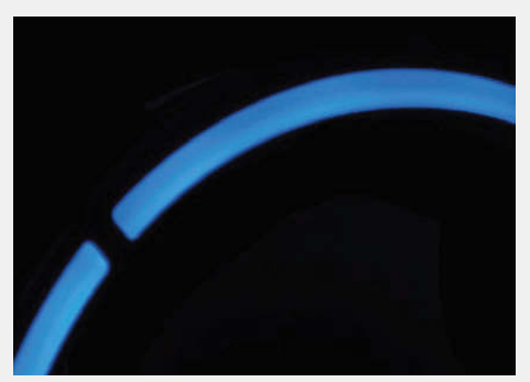
Incredibly bright and even lighting with no visible spots