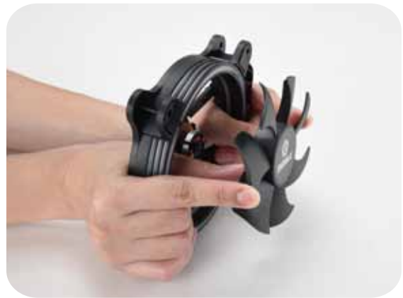
Detachable blade for easy cleaning

▼ Shockproof rubber pads minimize vibration during operation