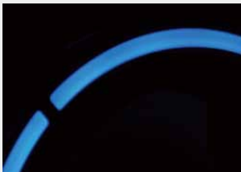
Incredibly bright and even lighting with no visible spots