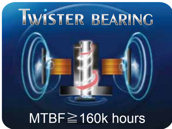
Long life and low noise