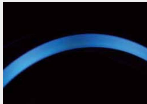
Uneven lighting with visible spots