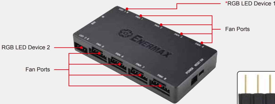
*RGB LED Pin Configuration