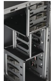
5.25" ODD kits x 3pcs / 3.5" HDD kits x 3pcs