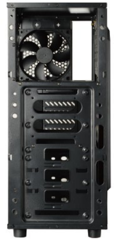
Dual front 12cm fans support