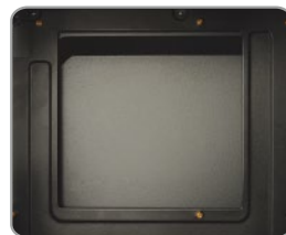
Cutout for CPU cooler montage