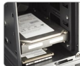
One extra 2.5" HDD space at the bottom