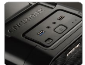
Top I/O for easy access