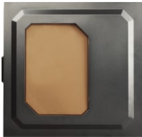
Acrylic extruded side panel