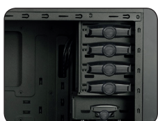
Tool-less design for easy installation

Two water cooling holes with rubber grommets at the back of the case.