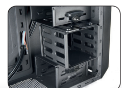
Removable HDD cage