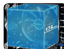
CPU Cooler support up to 174 mm