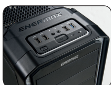
Top I/O and device tray for quick access