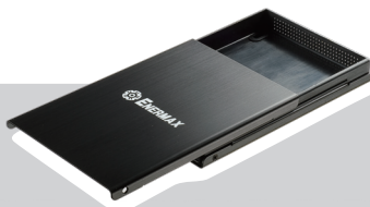
Release one screw, slide open