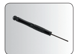
Screw driver included