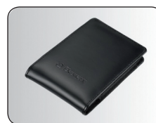
Leather-look carry bag