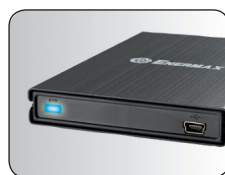
Dual mode status indicator