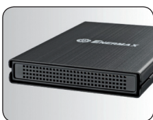
Air vents in the front