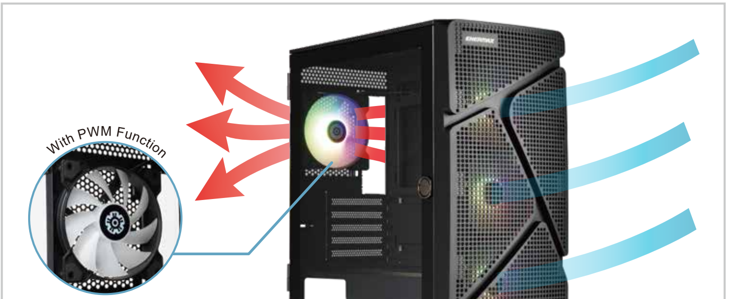
Pre-installed 4 ARGB PWM Fans