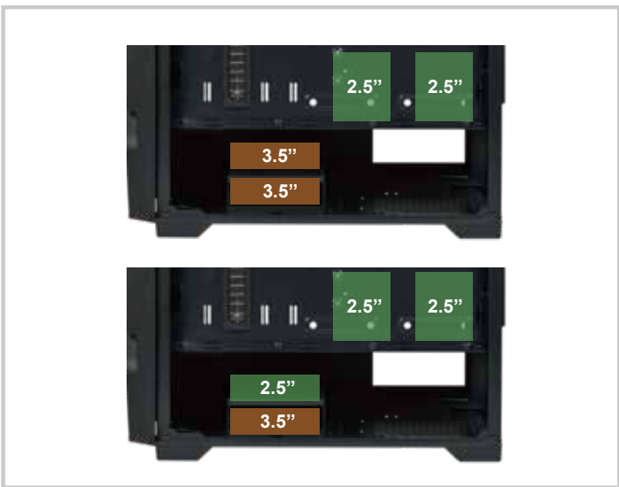
Support 2 x 3.5" and 3 x 2.5" (1 x Converted From 3.5" HDD Cage Drive Bay)