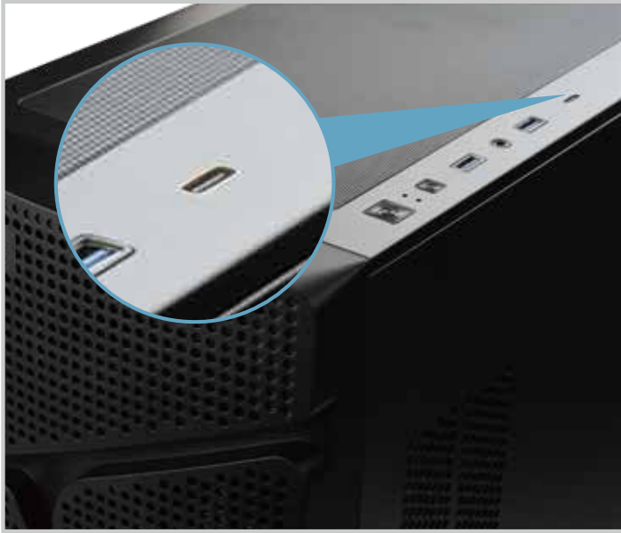
Build-in USB 3.2 Type C + USB 3.0 x 2