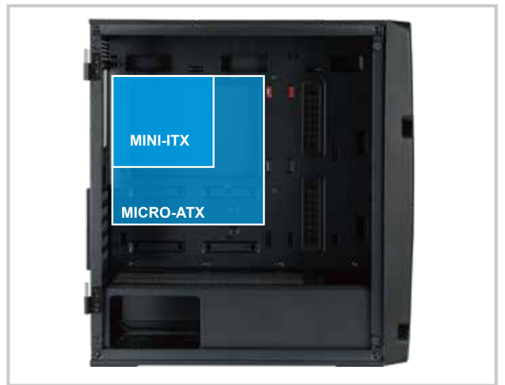
Mini ITX to Micro ATX Motherboard Compatibility