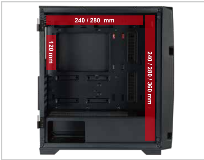
Support 360 AIO in 38mm Thickness