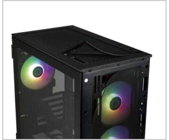
Magnetic Dust Filter on Both Top and Front Side