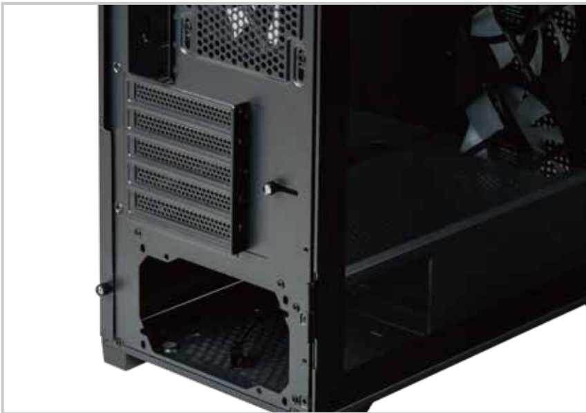
5 Reusable Expansion Slots