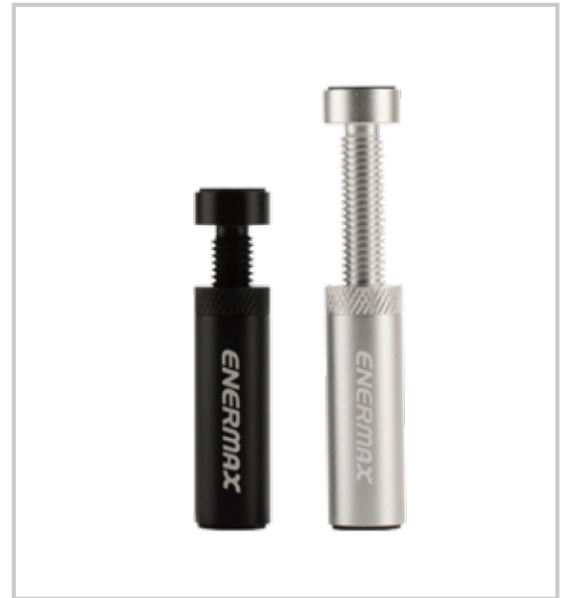
Comes with GPU Holder